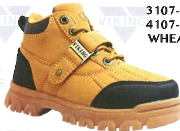
3107-16 4107-16 WHEAT