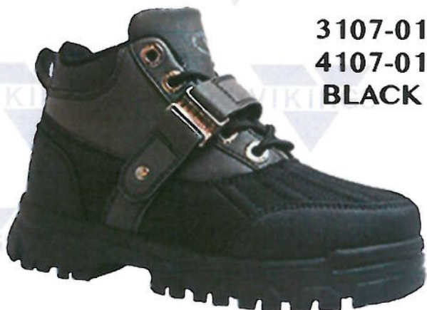
3107-01 4107-01 BLACK