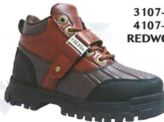
3107-13 4107-13 REDWOOD